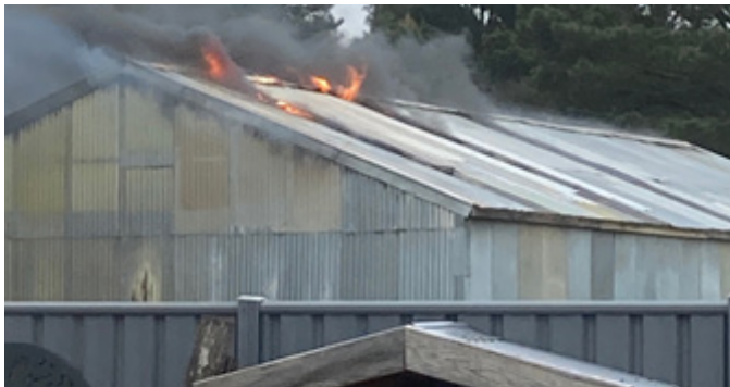
The flames break through the roof.

We are also running a fundraising dinner at Soltan 'Pepper on Sat Nov 26th. Three course meal - $50.00pp plus silent auction, minor games and other fun activities.