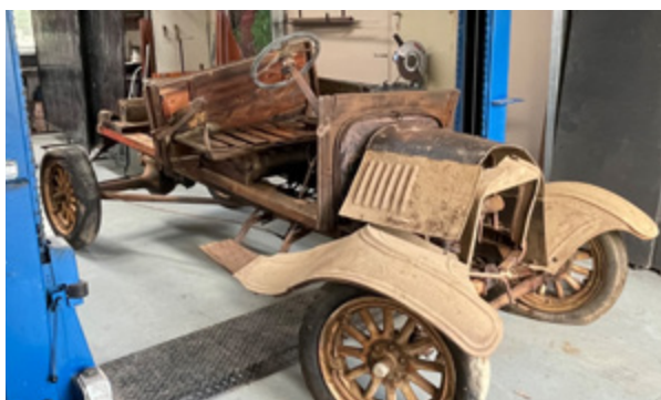
The T Model Ford now in our workshop.

Some projects are for the community, such as bird boxes, small restorations on chairs, toy boxes or other memorabilia.