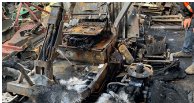
The remains of the fairway & greens' mowers.