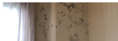
Mould in the SW corner.

The recent very heavy rains have again tested the RMI. So far, we have only had one small leak. We are tracking this down to see where the leak originated.