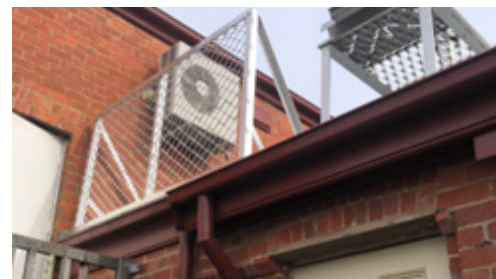
New Safety Barrier.

The Committee of Management has become aware of irregular access to the roof of the building. We have worked with "Elevated Safety Systems" to design and put in place a system that should make this type of roof access much more difficult. Sadly, this irregular access to the roof saw some spouting damaged resulting in water leaking down the outside wall and an area of mould in the main hall. This was easily cleaned off but we really have more things to do than repair this sort of vandalism.